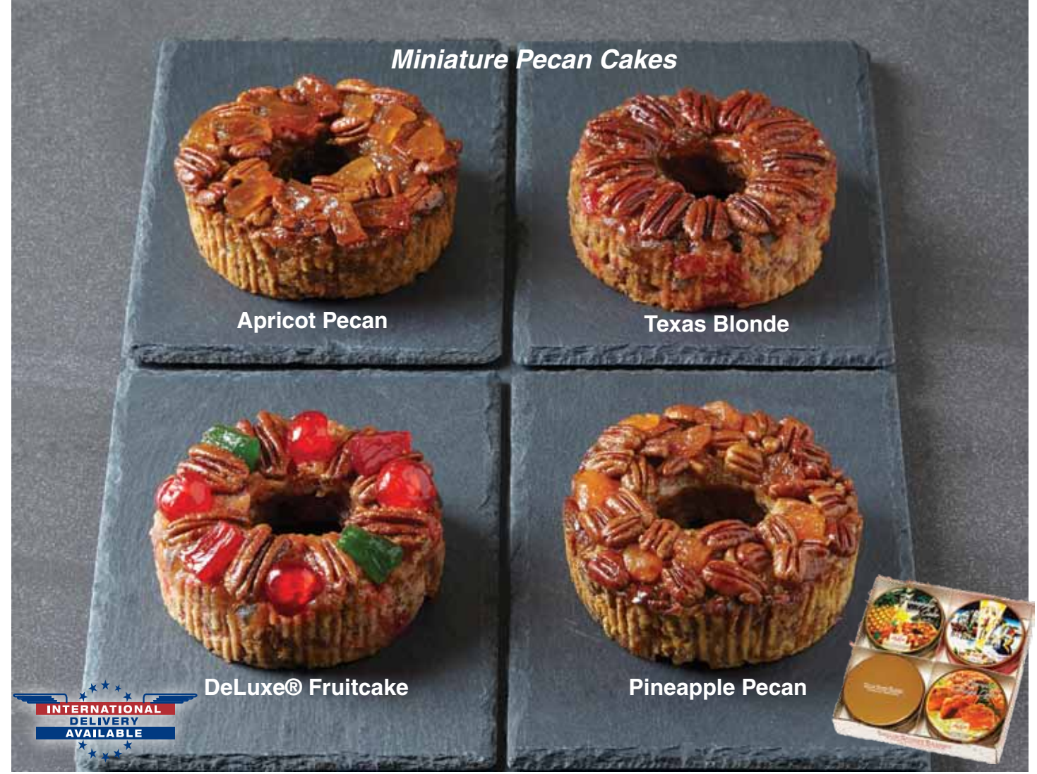
Miniature Pecan Cakes